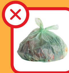
Plastic Bags (Including compostable or biodegradable)