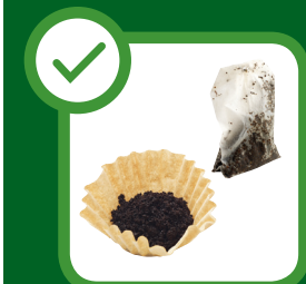
Coffee Filters, Coffee Grounds & Tea Bags