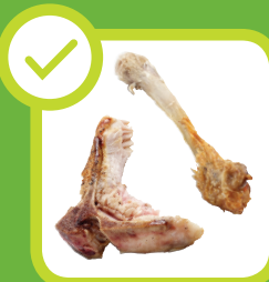
Meat & Bones