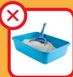
Pet Waste & Cat Litter