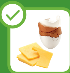
Eggs & Dairy