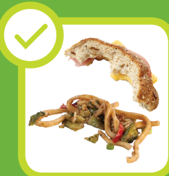
Noodles, Pasta, Grains & Bread