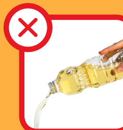
Oil, Grease & Liquids