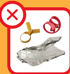
Twist Ties, Elastic Bands & Plastic or Foil Wrappers