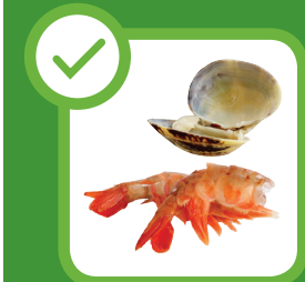
Fish, Seafood & Shells