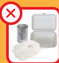
Styrofoam, Plastic, Glass, Metal, Tetra Pak or Foil Food Containers